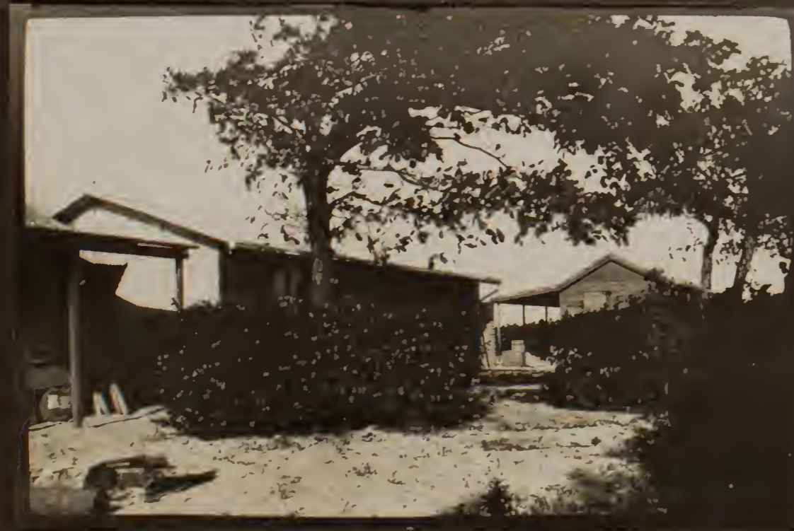
Native hut - Museum